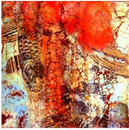
wimming Upstream by Mo Godbeer