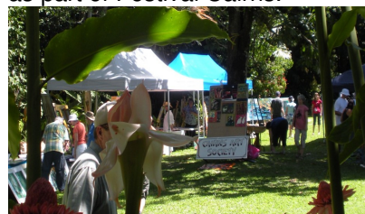
Cairns Art Society stand

A group of CAS members exhibited and painted at the Artistico arts, crafts and music event held at the Botanical Gardens on Saturday 29 August as part of Festival Cairns.